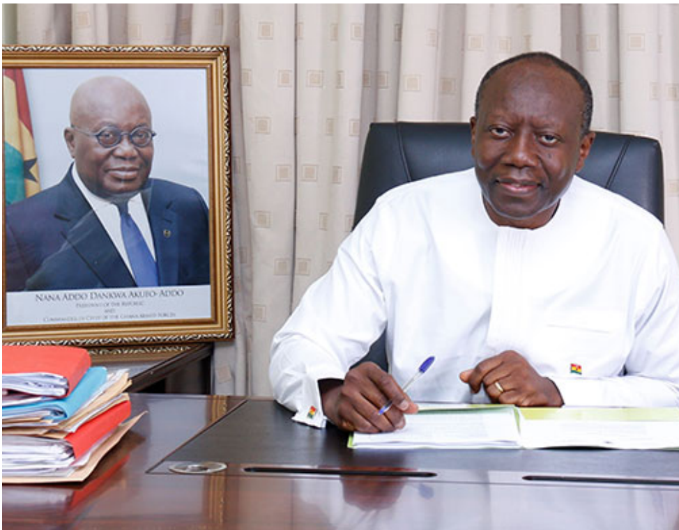
Finance Minister Ken Ofori-Atta